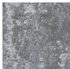
Cliff 15530 LRV 14.9